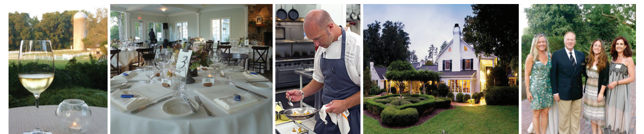
Fearington House Inn Estate